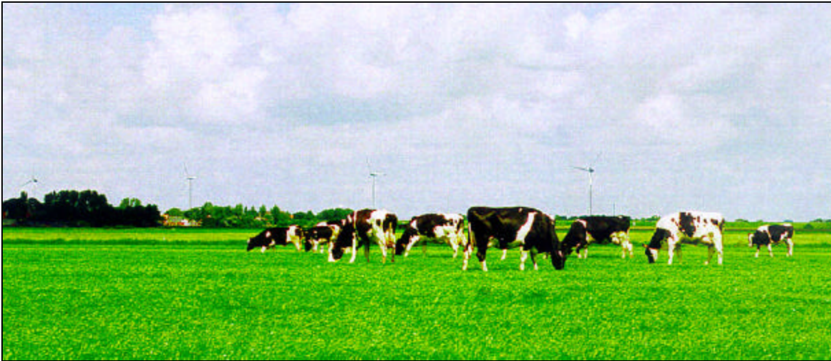
An artist's impression of one of the lines of turbines proposed in the plan.

In the preparation of the bestemmingsplan the municipality drew on this study to propose 8 areas for wind turbine development. Taking a cue from the very geometric landscape of the polder, the municipality proposed restricting new development to large MW size turbines in a series of five linear arrays along drainage channels and at three sites in smaller groups of turbines.